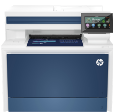
HP Color LaserJet Pro MFP 4303dw Printer

This printer is intended to work only with cartridges that have a new or reused HP chip, and it uses dynamic security measures to block cartridges using a non-HP chip. Periodic firmware updates will maintain the effectiveness of these measures and block cartridges that previously worked. A reused HP chip enables the use of reused, remanufactured, and refilled cartridges. More at: http://www.hp.com/learn/ds