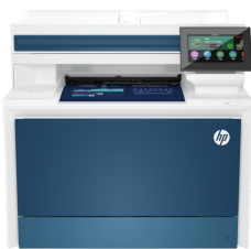
HP Color LaserJet Pro MFP 4303fdw Printer